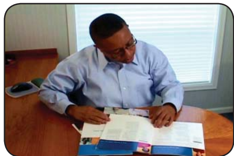
Thoroughly read insurance plans

Even though most plans pay only for basic services, we believe that you should be able to choose the most appropriate dental treatment for you and your family.